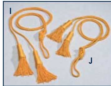
I. 39691 7" Tassel