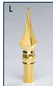
L. 39659 8" Point