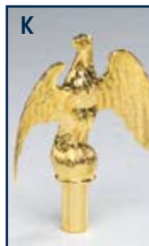
K. 39608 7" Eagle