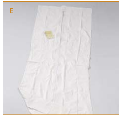
E. 8 MIL PVC BODY BAG Includes 3 ID information tags. Has universal precaution label attached. No Handles; Plastic Zipper with 1 Pull. 90" x 36" 408212 Straight Zipper 408239 Curved Zipper