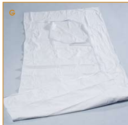
G. 5 MIL PVC BODY BAG No Handles; Metal Zipper with 1 Pull. 90" x 36" 461768 Curved Zipper 27189 Straight Zipper