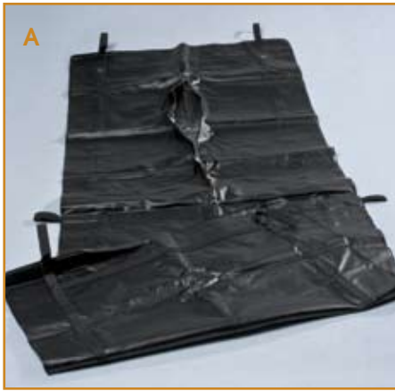
A. 20 MIL PVC EMERGENCY POUCH 6 Handles; Straight or Curved Plastic Zipper with 2 Pulls. 90" x 36" 27022 Straight Zipper 27014 Curved Zipper