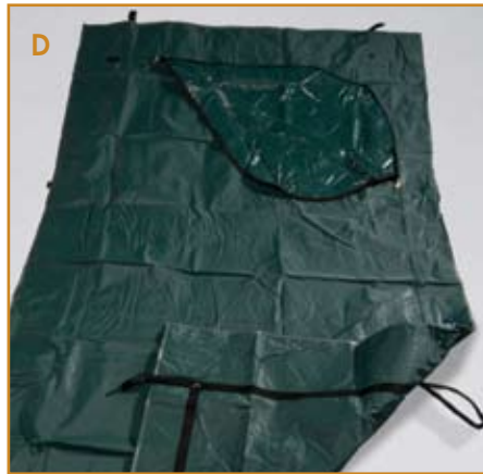
D. EMERGENCY POUCH Made with extra heavy duty 3 ply Herculite vinyl. Bound on all four sides with stitched handles riveted securely with a reinforced bottom. Heavy duty two-pull curved nylon zipper. 476897 6 Handles, 90" x 36"; Max. 600 lbs. 27606 8 Handles, 92" x 54"; Max. 750 lbs.