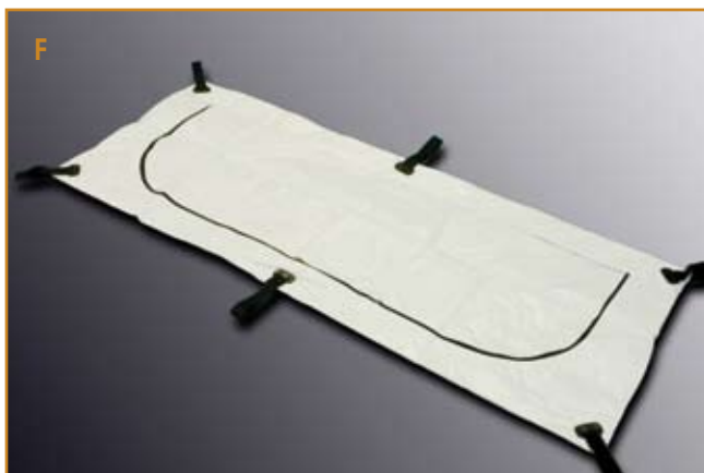
F. ENVIROMED-BAG® DELUXE Strong post mortem bags used for cremation, forensic and hospital applications. Made from environmentally friendly 8 mil polyolefin, has a heavy duty rust proof zipper with 2 extra long pulls for easy gripping. 6 handles and a curved zipper. Reinforced and tear resistant. 36" x 92". 577667