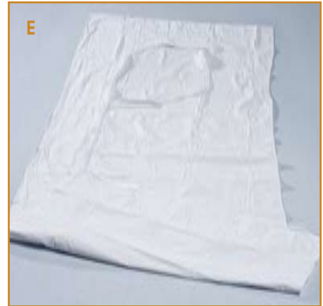
E. CREMATION POUCH Contains no polyvinyl chloride. Full-length; non-metallic zipper. No handles. 3 sizes. 27056 Infant, 26" x 18.5" 27058 Large, 90" x 36" 27059 XL, 94" x 38"