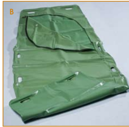
B. 20 MIL PVC EMERGENCY POUCH Extreme, Heavy Duty, 8 Handles; Curved Plastic Zipper with 2 Pulls. 89" x 37" 407992