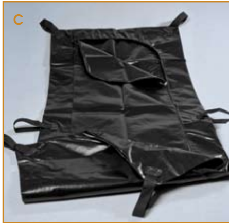
C. 20 MIL POLYPROPYLENE EnviroTough Body Bag™. Reinforced strong and durable mesh infrastructure. 6 Handles; Curved Plastic Zipper with 2 Pulls. 38" x 94". 577563