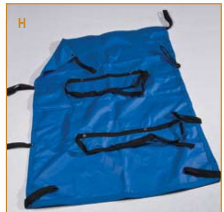
H. POUCH CARRIER Denier nylon with urethane coating. 3 adjustable hold down straps; 90" x 33". 10 handles. 408227