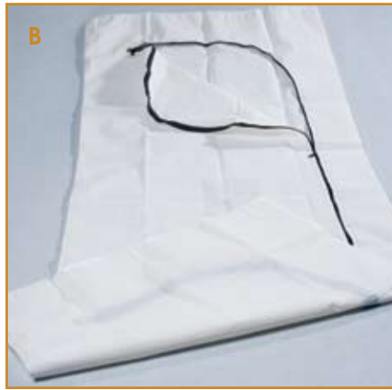
B. 8 MIL POLYPROPYLENE EnviroMed Body Bags™. Has a 8.75 in. x 6.5 in. transparent surface pocket for ID information. No Handles; Curved Plastic Zipper with 2 Pulls. 577536 92" x 36" 577659 96" x 40"