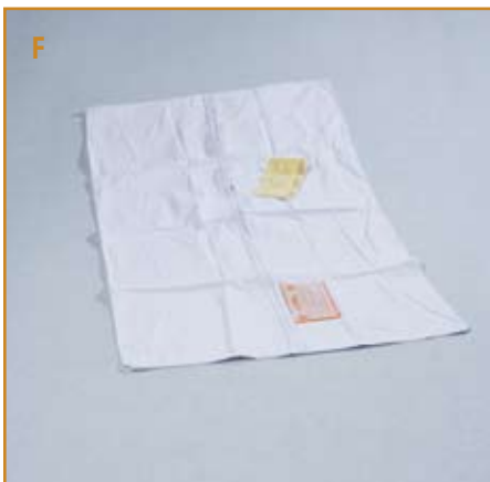
F. 8 MIL PVC INFANT PEDIATRIC POUCH Includes 3 ID information tags. Has universal precaution label attached. No Handles; Straight Plastic Zipper with 1 Pull. 36" x 20" 408225