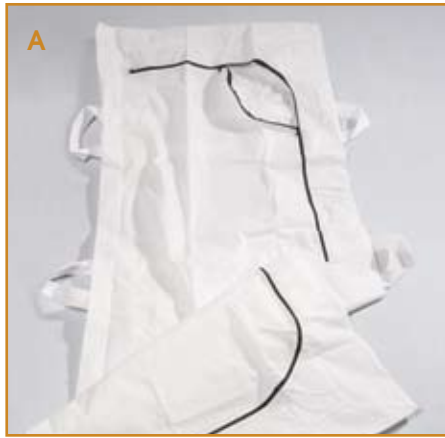
A. 14 MIL POLYPROPYLENE Enviro Body Bag™. Under body support straps are integral part of handles. 6 Handles; Curved Plastic Zipper with 2 Pulls. 94" x 38" 577585