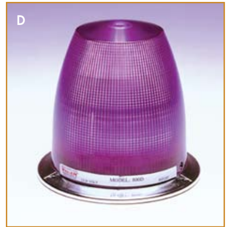
D. 800D DOMED STROBE 25 watts output power; input voltage/current draw: 12/24 VDC, 2.8/1.4 amps. High-profile, double fresnel optic dome provides 360 degree light dispersion. 6"H x 5.5" Dia., 2 lbs., 4 oz. Magnetic mount includes 50# pull magnet, 8 ft. power cord with cigarette lighter plug. 5-year warranty on power supply; 2-year warranty on strobe tubes. Easily converts to permanent mount. Please specify blue, amber, purple or red. 576542