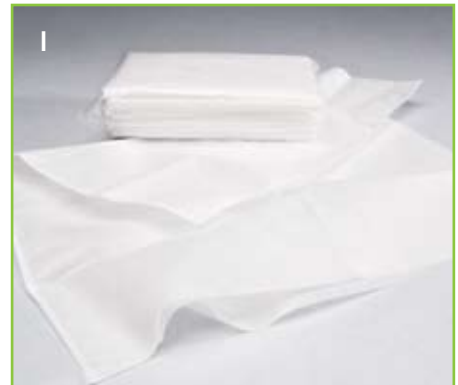
I. POLY-COATED KAYCEL® PILLOWCASES 20" x 31". Spun white paper material with poly-coating on one side to provide moisture resistance; non-hemmed. 12/pk. 142131