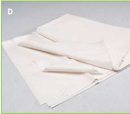
D. OPAQUE PLASTIC SHEET 48" x 92"; 4 mil, moisture proof, embossed, non-hemmed, opaque white plastic. 1/ea. 27596