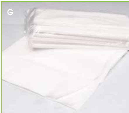
G. PLASTIC SHEETS & PILLOWCASES 1 mil, moisture proof, embossed, non-hemmed opaque white plastic. Sheets: 44" x 90"; 12/pk. pillowcases: 21" x 32"; 12/pk. 142018 Sheets 142085 Pillowcases