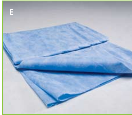
E. KIMBERLY-CLARK™ SHEETS 60" x 96". Superior quality and performance. Base material is 3-layer SMS blue polypropylene designed to feel like cloth while providing excellent durability and moisture resistance; non-hemmed. 30/case. 38393