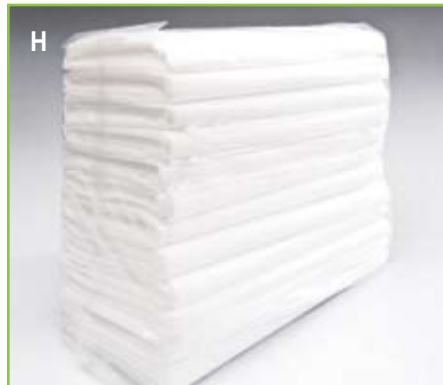
H. POLY-COATED KAYCEL® SHEETS 44" x 90". Spun white paper material with poly-coating on one side to provide moisture resistance; non-hemmed. 12/pk. 38334