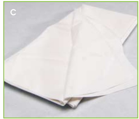
C. PLASTIC SHEETS 54" x 96"; 4 mil, moisture proof, embossed, non-hemmed opaque white plastic. 12/dispenser box. 508667