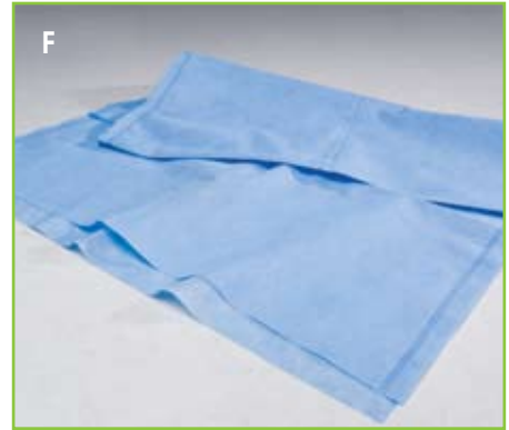
F. KIMBERLY-CLARK™ PILLOWCASES 20" x 29"; Superior quality and performance. Base material is 3-layer SMS blue polypropylene designed to feel like cloth while providing excellent durability and moisture resistance; non-hemmed. 200/case. 38407