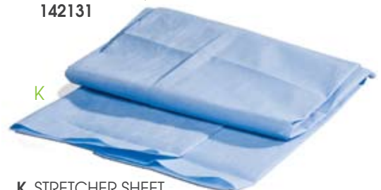
K. STRETCHER SHEET 3-layer blue polypropylene. Moisture resistance; non-hemmed 40" x 84", 80/pk. 38458