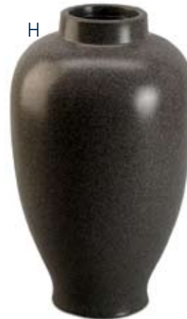
H. 27" VASE 610271