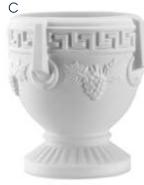
C. 610295 10" 610311 13"