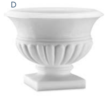
D. 610323 11"