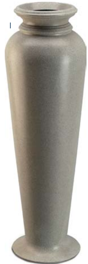
I. 55" FLOOR VASE 610283