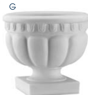
G. 610373 12"