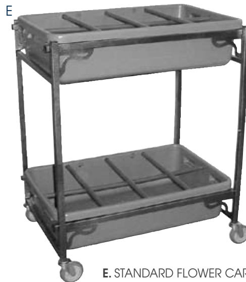
E. STANDARD FLOWER CART Moves up to 16 plants. 40.5"H x 24.25"W x 34"L; 57 lbs.