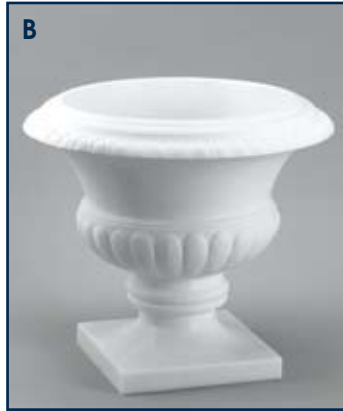
B. 610384 19"