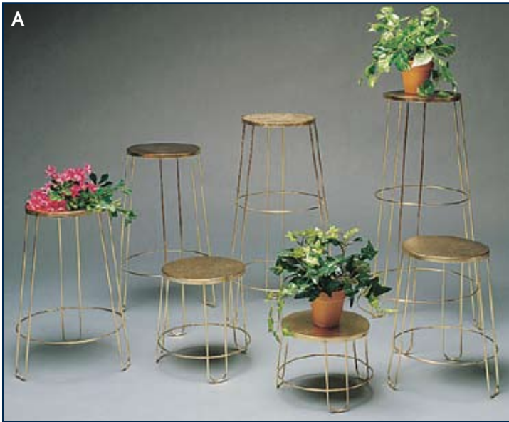
A. BRASS PLATED ROUND NESTING BASKET STAND SET

139572 7-Piece: 8", 12", 16", 20", 24", 28", 32"