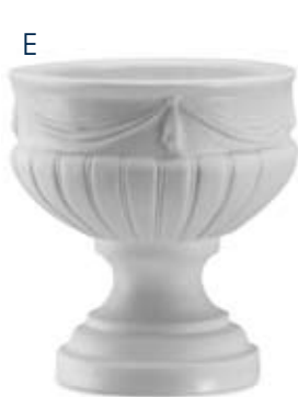
E. 610335 14"