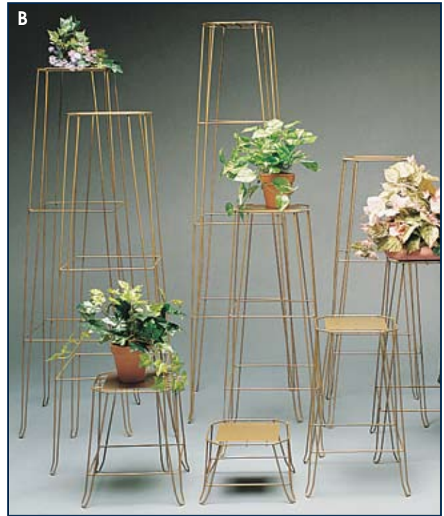
B. SQUARE NESTING BASKET STAND SET

Heavy gauge wire stand with flat metal steel plate top. Gold painted finish.