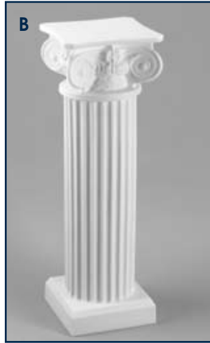
B. DORIC COLUMN With Scamozzi Capital.