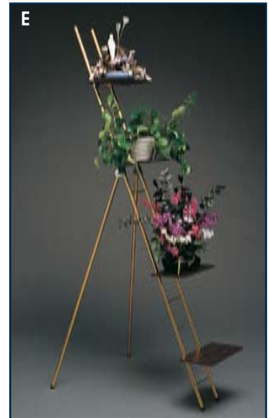
E. LADDER RACK

507873 Set/7; 8", 14", 20", 26", 32", 38" & 44"