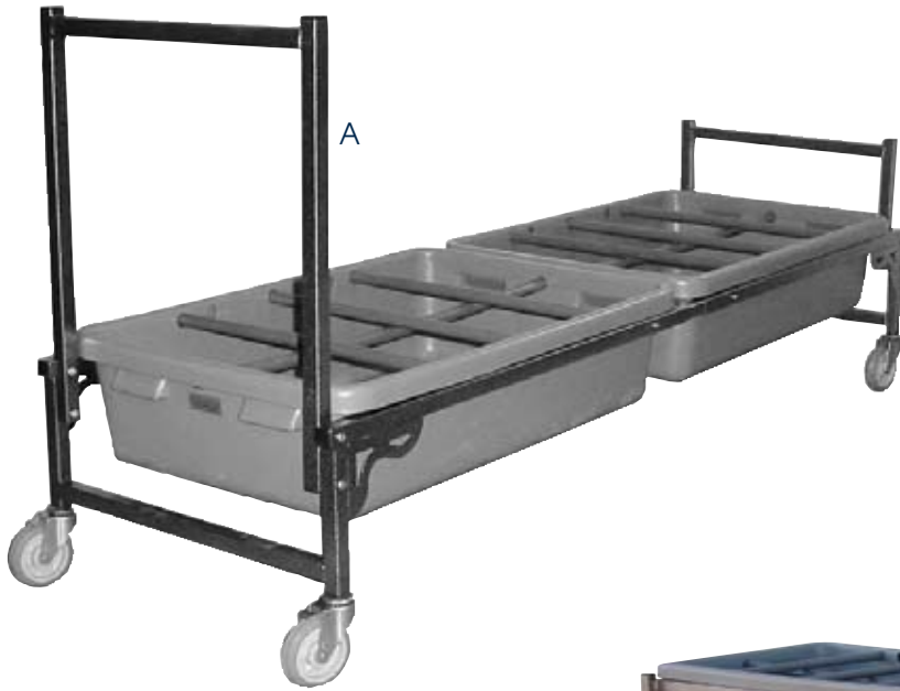
A. VEHICLE FLOWER CART Fits easily into your vehicle. 35.5"H x 22"W x 75"L; 42 lbs. 356342