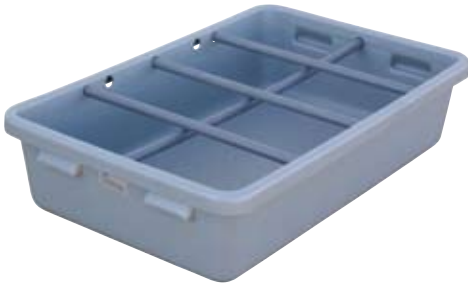
B. ADDITIONAL FLOWER TRAY No spill, adjustable-size divider system. 8"H x 22"W x 34"L. 356375