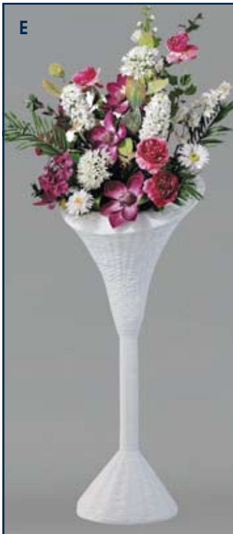
E. 48" PLASTIC FLOWER BASKET 610395