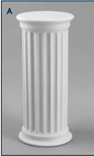
A. DORIC PEDESTAL