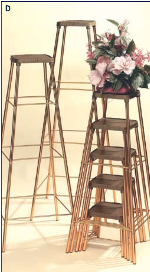
D. NESTING DISPLAY STANDS