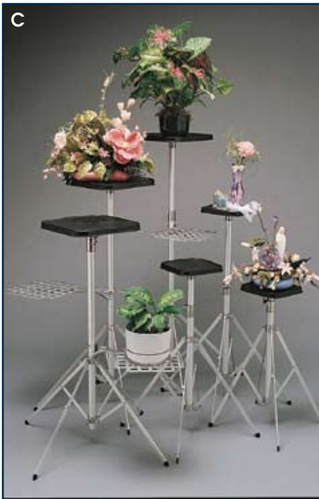
C. ADJUSTABLE BASKET STAND

Strong, yet lightweight. Holds baskets up to 70 lbs. Shelf attachment locks onto the outside tube, at any height. Order shelves separately. Interchangeable black heads.