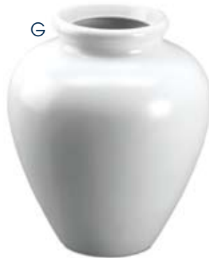
G. 22" VASE 610268