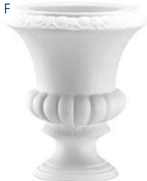
F. 610347 20" 610359 22"