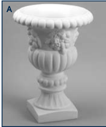
A. 610362 27"