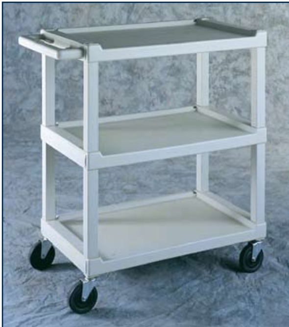
D. ECONOMY POLYETHYLENE/ABS CART Rugged polyethylene shelves resist stains and odors; ABS legs provide extra rigidity; rubber swivel casters. Shipped unassembled via UPS for easy "no-tool" assembly. Overall dimensions 17.125" x 32.5" x 34.875"; shelf size 15.5" x 24"; 3 shelves; shelf clearance 12.125"; load capacity 200 lbs.; shipping weight 32 lbs.