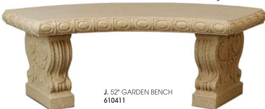
J. 52" GARDEN BENCH 610411