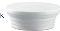
K. CLASSIC ROUND CAPITAL 610256