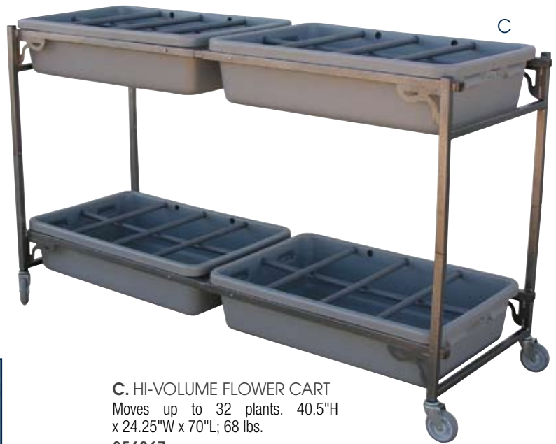
C. HI-VOLUME FLOWER CART Moves up to 32 plants. 40.5"H x 24.25"W x 70"L; 68 lbs. 356367