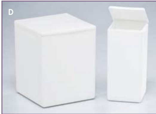
D. KEL-DELUXE WHITE PLASTIC TEMPORARY URNS Two sizes; one-piece construction in high-impact plastic; cremains liner and twist tie are included. Closure: snap-lock lid; Small: 4"Sq x 5"H; 78 cu. in.; Mini: 2.5"Sq x 5"H; 32 cu. in. 570737 Small Urn 570745 Small Urn, Case of 24 570702 Mini Urn 570729 Mini Urn Case of 24