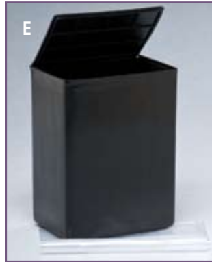
E. PLASTIC TEMPORARY URN One piece construction. Includes bag and tie. 6.25" x 4.25" x 8.25"H. 163 cu in. 36/case. 511285