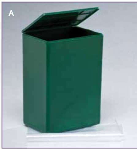
A. KEL-DELUXE PLASTIC TEMPORARY URN One-piece construction in high-impact plastic; cremains liner and nylon cable tie are included; mailing box sold separately. Snap-lock lid; 6.125"L x 4.25"D x 8.5"H; 215 cu. in. 570656 Urn 570664 Urn, Case of 24 570672 Mailing box