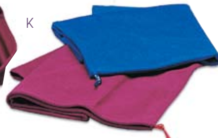
K. PRESENTATION COVER Royal blue or burgundy velour; satin drawstring. A tasteful presentation method for a temporary or permanent urn. 511927 Large, 17.5"L x 18"H 511935 Medium, 15"L x 18"H 511943 Small, 9.75"L x 12.5"H