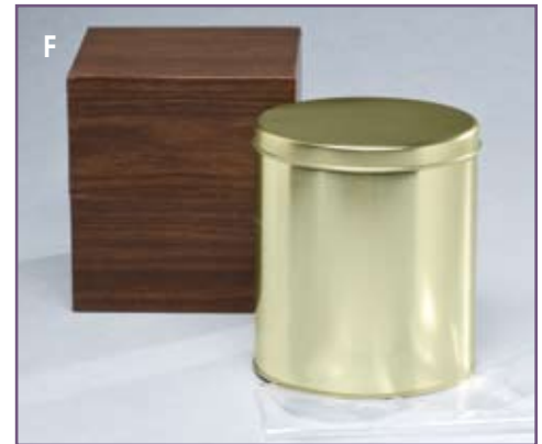
F. ROUND UTILITY METAL TEMPORARY URN Goldtone with friction-fit lid. Includes faux woodgrain mailing box. 6" Dia x 6.75"H; 160 cu.in. 48/case. 225428