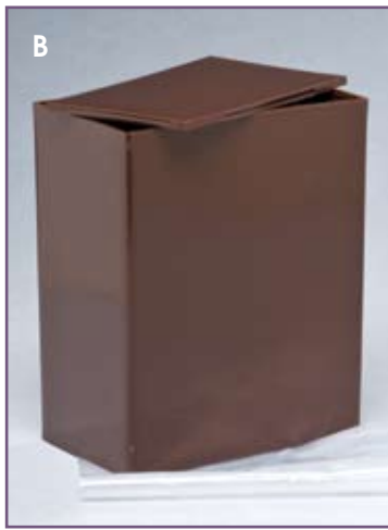
B. PLASTIC TEMPORARY URN "Snap-n-Seal" interlocking lid. Complete with liner and tie. 7.125" x 4.375" x 8.75"H. 200 cu in. 515337 Urn, 12/case 515345 Mailing box, 36/case