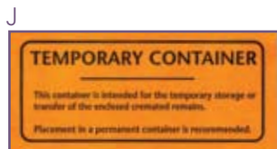
J. TEMPORARY CONTAINER LABEL Peel & Stick. Fluorescent. 4.75"L x 2"H. 100/roll. 570621