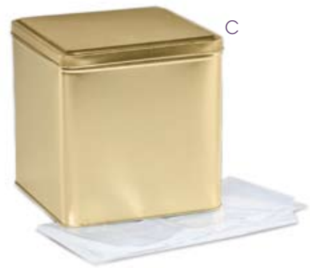
C. SQUARE UTILITY METAL TEMPORARY URN Goldtone with friction-fit lid. Includes cremains liner and twist tie. White cardboard mailing box is sold separately. 5.75"Sq x 6.5"H; 206 cu in. 500909 Urn, 12/case 500917 Mailing box, 48/case