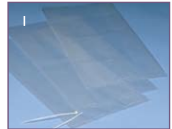
I. CREMAINS LINERS & CABLE TIES Heavy-duty, 4 mil, gusseted polybag; 5" nylon cable tie. 25/pk. 526967