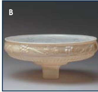
B. SPRING FLUTE REFLECTOR Embossed design. 16" Dia. x 7.25"H, 2.75" shank. 27316