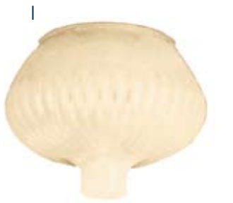
I. VIRTUOSO REFLECTOR 12" Dia., 2.75" shank. 500496