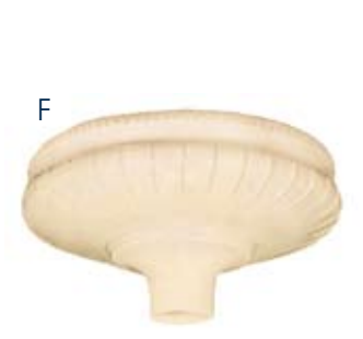
F. FLUTED REFLECTOR 13.5" Dia., 2.75" shank. 556445