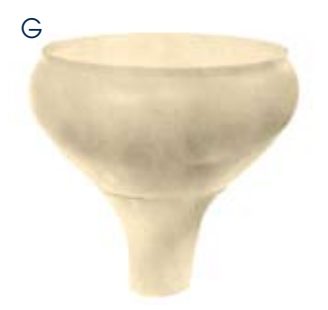
G. OPEN GLOBE REFLECTOR 11" Dia., 3" shank. 556432