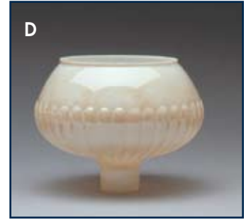
D. SCALLOPINE REFLECTOR Scalloped design. 8.5" Dia. x 9.5"H, 1.75" shank. 27367