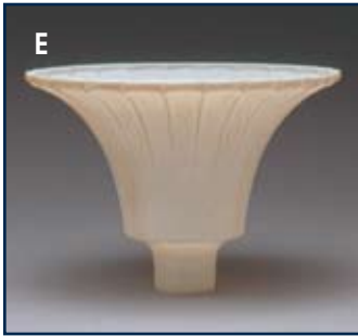
E. TULIP REFLECTOR. Fluted petal design. 16" Dia. x 7"H, 2.75" shank. 27375