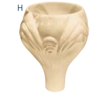
H. DECORATIVE REFLECTOR 8.5" Dia. top, 12.5"H, 3" shank. 556467