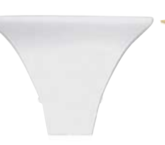
K. LORD BALTIMORE REFLECTOR 13.5" Dia. , 3.5" shank. 528889