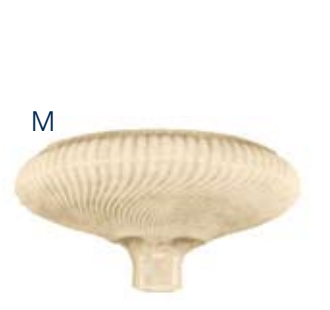
M. EMBOSSED REFLECTOR. 16" Dia., 2.75" shank. 556319