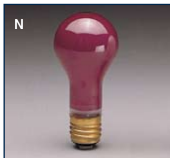
N. LIVE TINT MOGUL BULB. 3-way, 100/200/300 watt. Estimates 1,200 hours of use. Will not peel. 48909