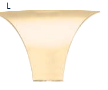
L. SIGNATURE REFLECTOR 13.5" Dia., 3.5" shank. 528854