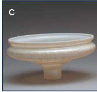
C. PIPER REFLECTOR Embossed design. 13.5" Dia. x 6.5"H, 2.75" shank. 27553