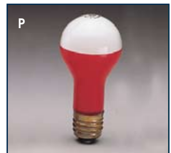
P. REDNECK MOGUL BULB 3-way, 100/200/300 watt. Estimates 1,200 hours of use. Will not peel. 205002