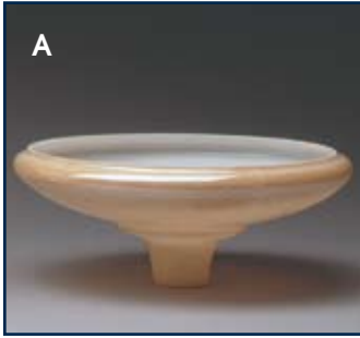
A. CROWN REFLECTOR Swirl design. 16" Dia. x 7"H, 2.75" shank. 27618

To match the replacement reflector to the lamp, note the shank size of each.