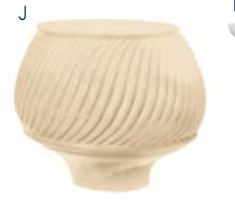
J. SILHOUETTE REFLECTOR 11" Dia., 4" shank. 500488